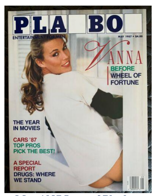
May 1987 Issue of Playboy

White filed a $5.2 million lawsuit against the magazine, hoping to halt the publication of her image. She claimed the photos would tarnish her image as a modest, wholesome, attractive, and innocent all-American girl.