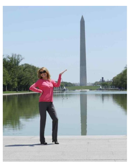
Not too bad for age 65!!

You now know a little bit more about that letter turner on Wheel of Fortune.