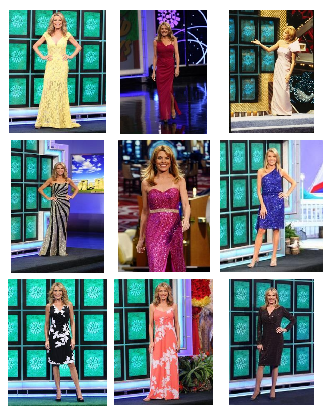
You may be wondering how Vanna can afford over 7,000 dresses and how in the world do they all fit in her closet? Well, you will learn the answers next.