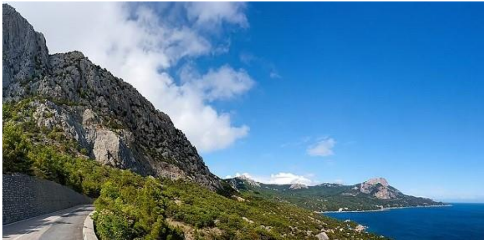
Black Sea Coastline

Normally, Ukraine is quite safe to visit, except for the Donetsk and Lugansk regions (where war has been going on for years). Ukraine has numerous tourist attractions: mountain ranges suitable for skiing, hiking and fishing; the Black Sea coastline as a popular summer destination; nature reserves of different ecosystems; churches, castle ruins and other architectural and park landmarks; various outdoor activity points. The major tourist destinations are the cities of Kyiv, Lviv, Odessa, and Chernivtsi.