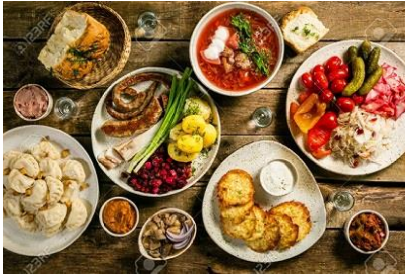
Borsch perogie (borsch) with pickled potato and carrot cake