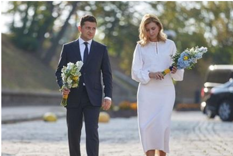
Ukraine's first lady Olena Zelenska issues plea to the world: 'STOP WAR'

Both are 44 years old, and both speak fluent English.