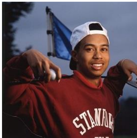
Tiger Woods at Stanford University

In only two years at Stanford, Tiger won a Stanford record tying 11 tournaments, including an incredible 8 wins in 13 starts in 1996. Woods was twice named a 1st team All-American - in both 1995 and 1996. He was the NCAA individual champion in 1996 and was named the Jack Nicklaus national player of the year.