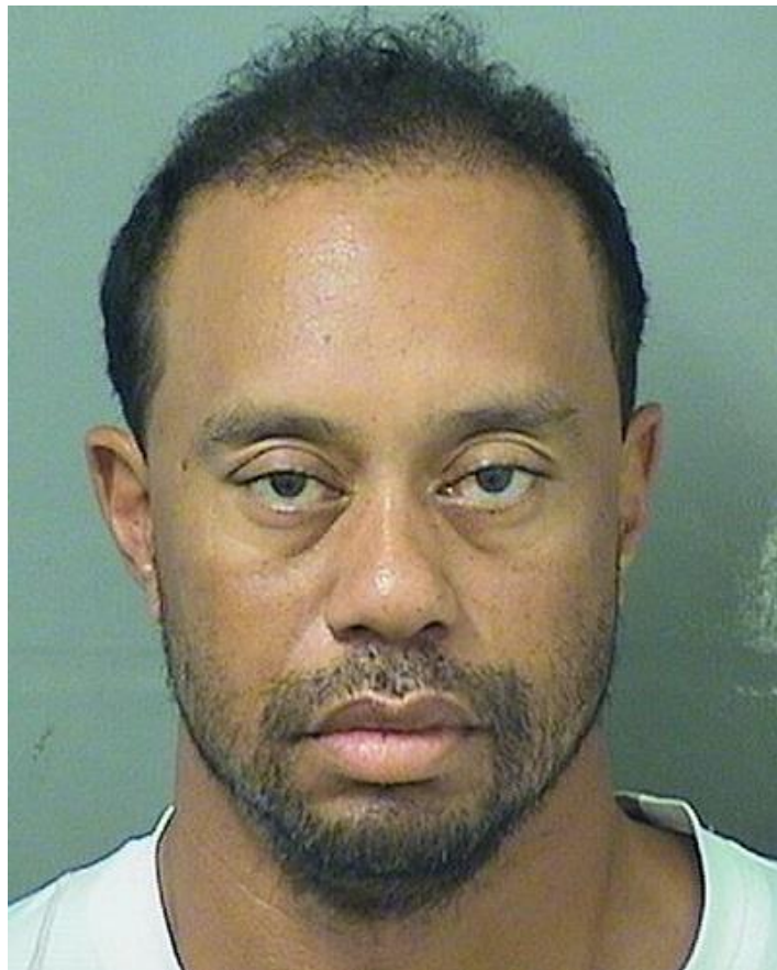
Tiger Woods – Under Arrest for DUI in 2017 (Probably the worst picture of Tiger ever!)

Woods had five drugs in his system, toxicology report shows. He said in a statement that he had been trying to treat his back pain and insomnia on his own but 'I realize now it was a big mistake.'