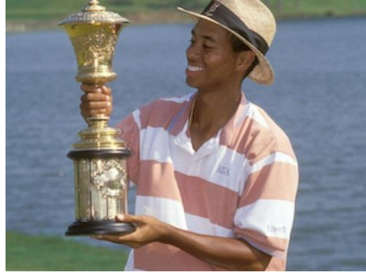
1994 US Amateur Champion

Tiger Woods is the only player to have won 3 consecutive US Amateur and US Junior Amateur titles in a row.