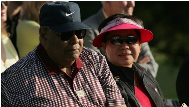
Tiger's Father Earl Woods and his Mother Kultilda Woods

When Woods was a child, his father began calling him "Tiger" in honor of a fellow soldier and friend who had the same moniker.