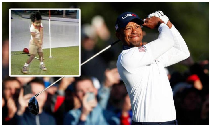
Tiger Hitting the Golf Ball at Age 2 (inset) and at Age 20