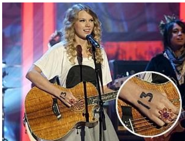
Swift's lucky number is 13

One of her favorite items of clothing she likes to wear is a pair of cowboy boots.