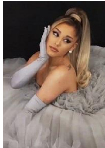
#3 Ariana Grande