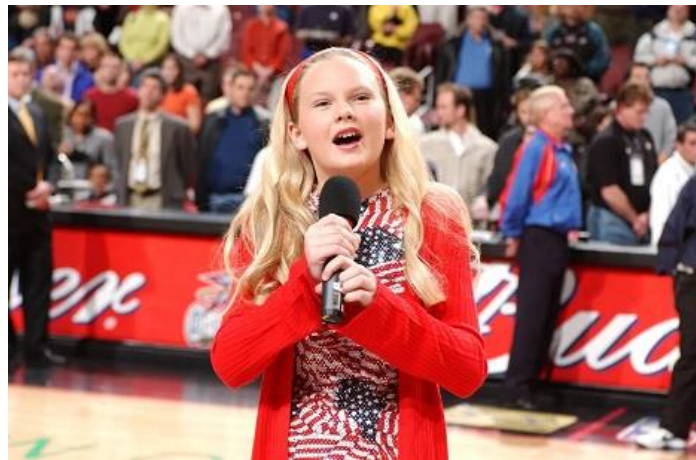
Singing "The Star-Spangled Banner" at age 11

Swift showed an interest in music at an early age, and she progressed quickly from roles in children's theater to her first appearance before a crowd of thousands. She was age 11 when she sang "The Star-Spangled Banner" before a Philadelphia 76ers basketball game, and the following year she picked up the guitar and began to write songs.