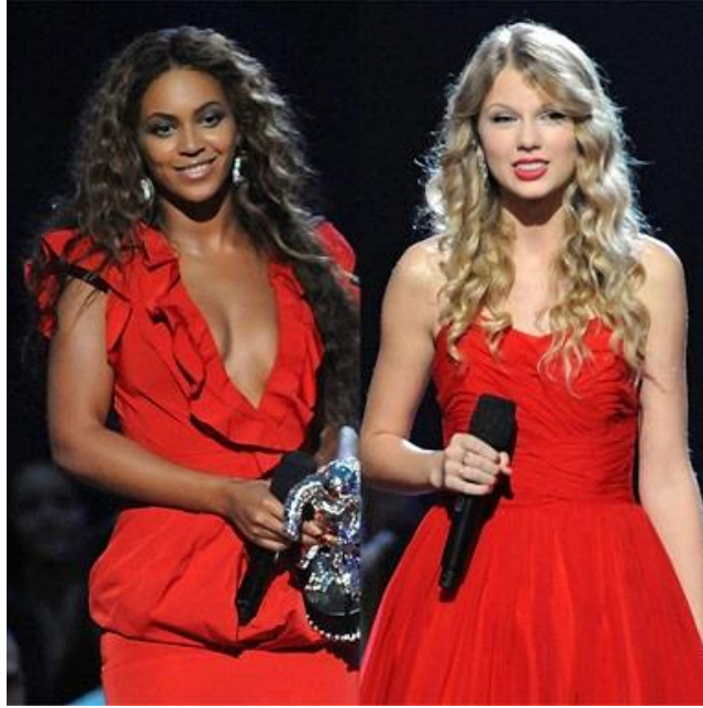
Beyonce and Swift at the 2009 VMA's