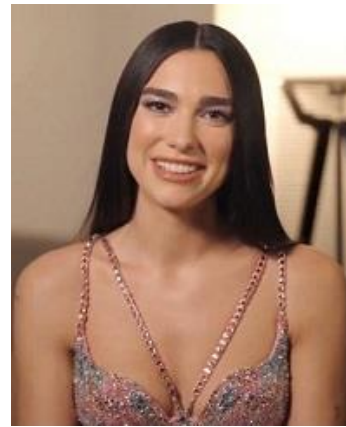
#5 Dua Lipa