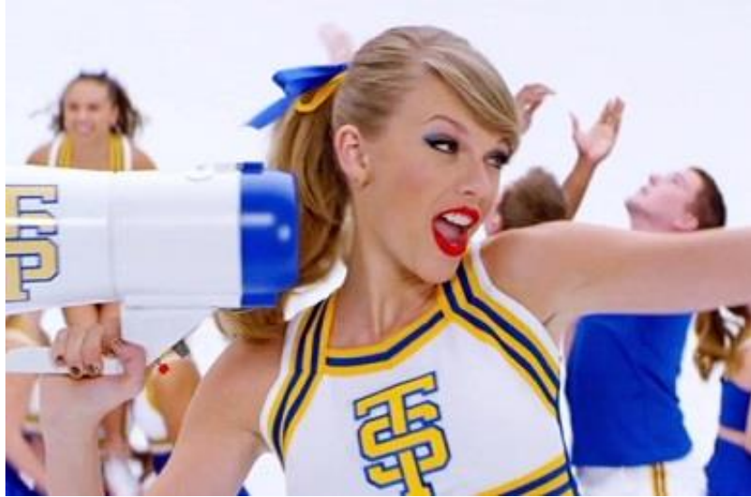
Shake It Off