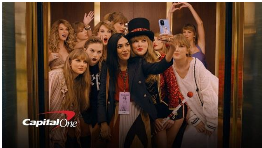
Taylor Stars in 2022 Capitol One TV Commercial

You now know more than you ever wanted to know about Taylor Swift.