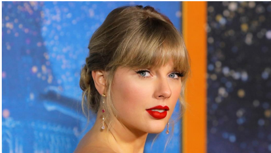
Taylor Swift's Transformation Over the Years