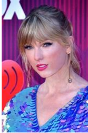
#1 Taylor Swift

Taylor Swift is most popular and most famous female singer in the world right now in 2022. Here are the top five: