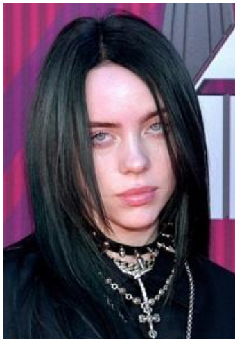
#2 Billie Eilish