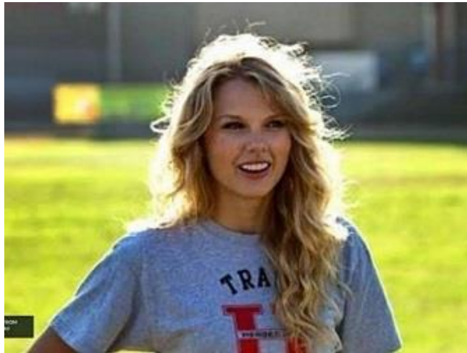
Valentine's Day Movie