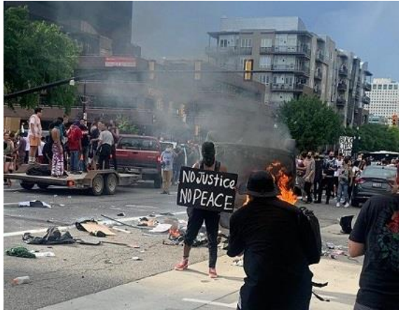
Protesters in Salt Lake City, Utah

Protesters who incited, set fires, broke windows, looted, destroyed statues, and/or attacked police and other civilians should be arrested, tried as Domestic Terrorists and put in jail.