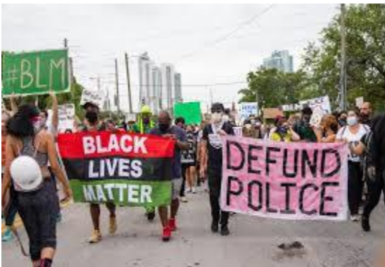
Protesters Want to Defund the Police

DEFUND THE POLICE or in other words, GET RID OF THE POLICE.