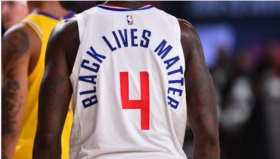
Black Lives Matter May Be the Largest Movement in U.S. History

The recent Black Lives Matter protests (and riots) peaked on June 6, when half a million people turned out in nearly 550 cities across the United States. That was a single day in more than a month of protests that still continue to this writing in Mid-September 2020. Example: Portland Police arrest over 50 people on 100th consecutive night of violent demonstrations.