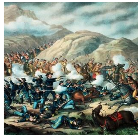
General Custer's Last Stand

The Indians did fight back and won a few battles. The Battle of the Little Bighorn was an armed engagement between combined forces of the Lakota, Northern Cheyenne, and Arapaho tribes against the 7th Cavalry Regiment of the US Army. The battle, which resulted in the defeat of U.S. forces, was the most significant action of the Great Sioux War of 1876. It took place along the Little Bighorn River on the Crow Indian Reservation in southeastern Montana Territory.