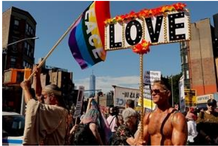
Some LGBTQ Individuals Protesting

When it comes to wages in the workplace, there is a noticeable differentiation between men and women. According to the American Association of University Women (AAUW), today in 2020, the gender pay gap from men and women for the same job was 82 percent. Stated simply, women make 82 percent of what men make doing the same work.