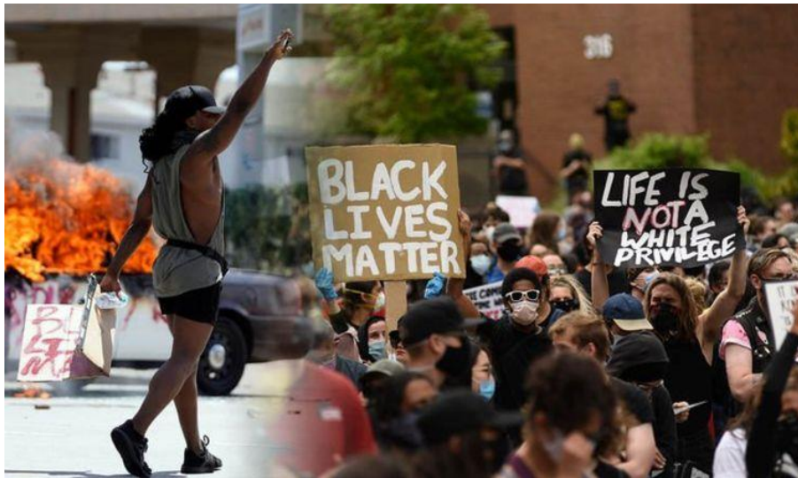
Portland, Oregon has had more Protests and Riots than any other US city

The recent Black Lives Matter protests (and riots) peaked on June 6, when half a million people turned out in nearly 550 cities across the United States. That was a single day in more than a month of protests that still continue to this writing in Mid-September 2020. Example: Portland Police arrest over 50 people on 100th consecutive night of violent demonstrations.