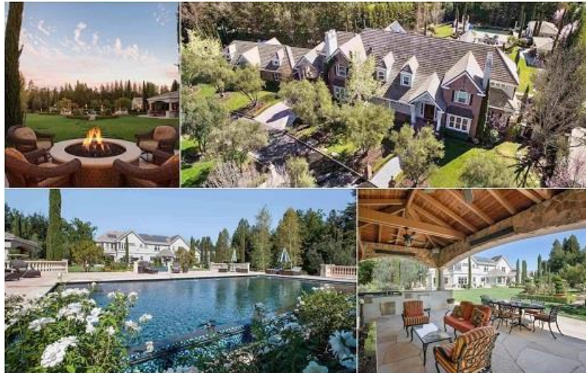
Steph Curry’s New $6 Million Dollar Mansion

One more thing. Back to those NBA basketball players. The average salary in the NBA is $7.7 million dollars a season. The more famous players like Lebron James and Steph Curry make more than $37 million a season plus another $50 million plus for endorsements. Most players are millionaires and live in mansions located in exclusive “gated” communities. In 2020, 81% of players in the NBA are black. Life cannot be too bad for these guys and their families.