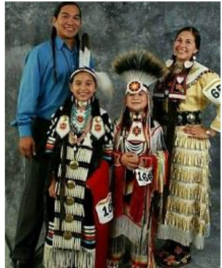
American Indian Family

There are 567 tribes that are recognized by the federal government and this entire diverse race of people are subjected to racial abuse, social discrimination, wrong depiction in mental, spiritual, and physical violence. These historical and social hurdles have resulted in many Native Americans becoming alcoholics and suicide potentials.