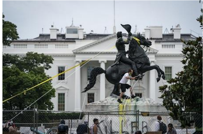
Protesters Tear Down Statue of Andrew Jackson