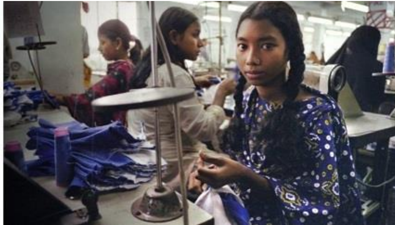
Children Forced to work in Factories in India

Laws are in place around the world to ensure a safe work environment for children. These laws were drafted from historically harsh and dangerous working conditions for children. While many would like to believe that child labor is a thing of the past, it persists in some areas around the globe.