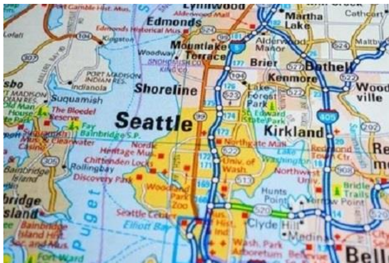
Seattle Area Maps

Seattle is rated as one of America's greatest cities. With a population of about 750,000, it is the largest city in both the state of Washington and the Pacific Northwest. The Seattle metropolitan area's population of over 4 million makes it the 15th-largest in the United States. Seattle is situated on an isthmus between Puget Sound (an inlet of the Pacific Ocean) and Lake Washington. As you can see on the above maps, there is a lot of water around the Seattle area. It is the northernmost major city in the continental United States, located about 100 miles south of the Canadian border. A major gateway for trade with East Asia, Seattle is the fourth-largest port in North America.