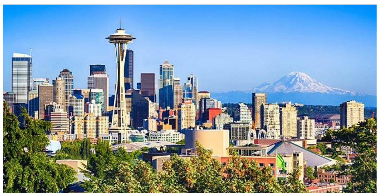
Seattle with Mt. Rainier in the background