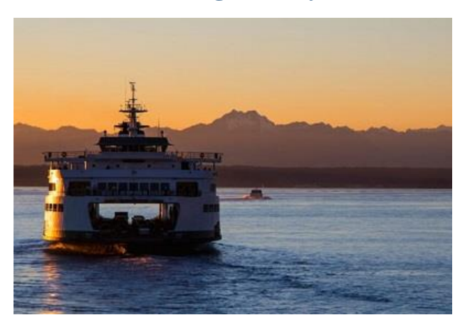
Washington State Ferries