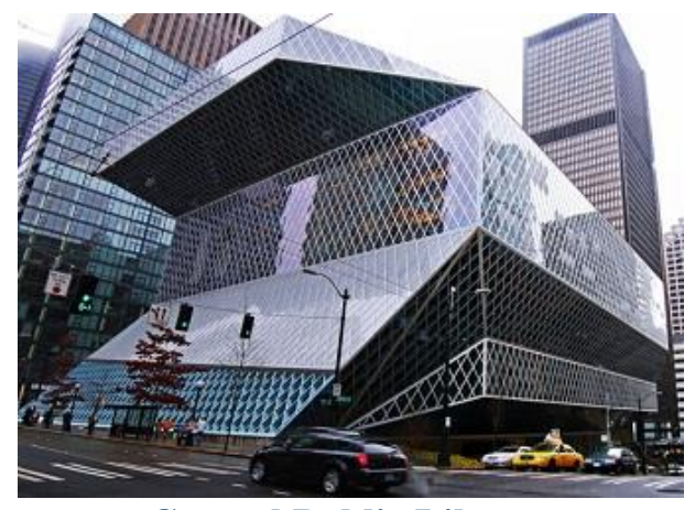
Central Public Library