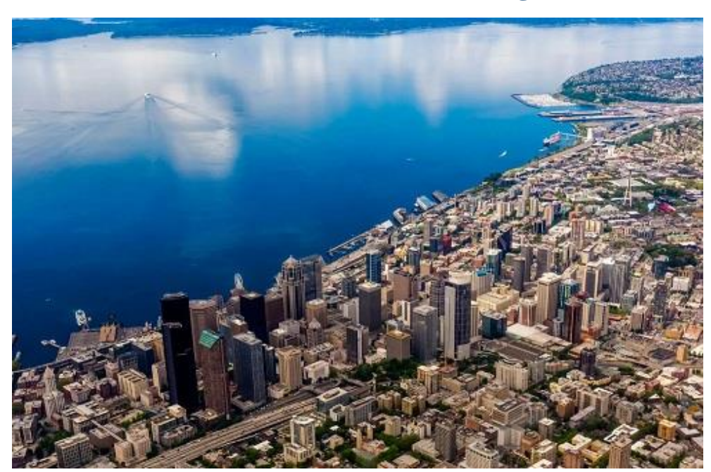
Seattle on the shores of Puget Sound