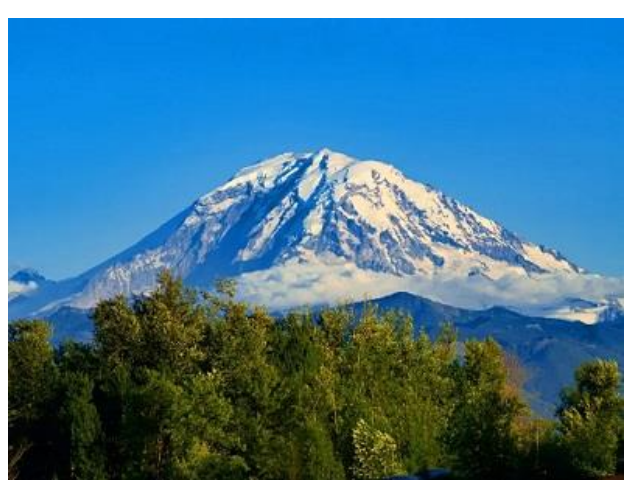
Mt. Rainier (60 miles from Seattle)