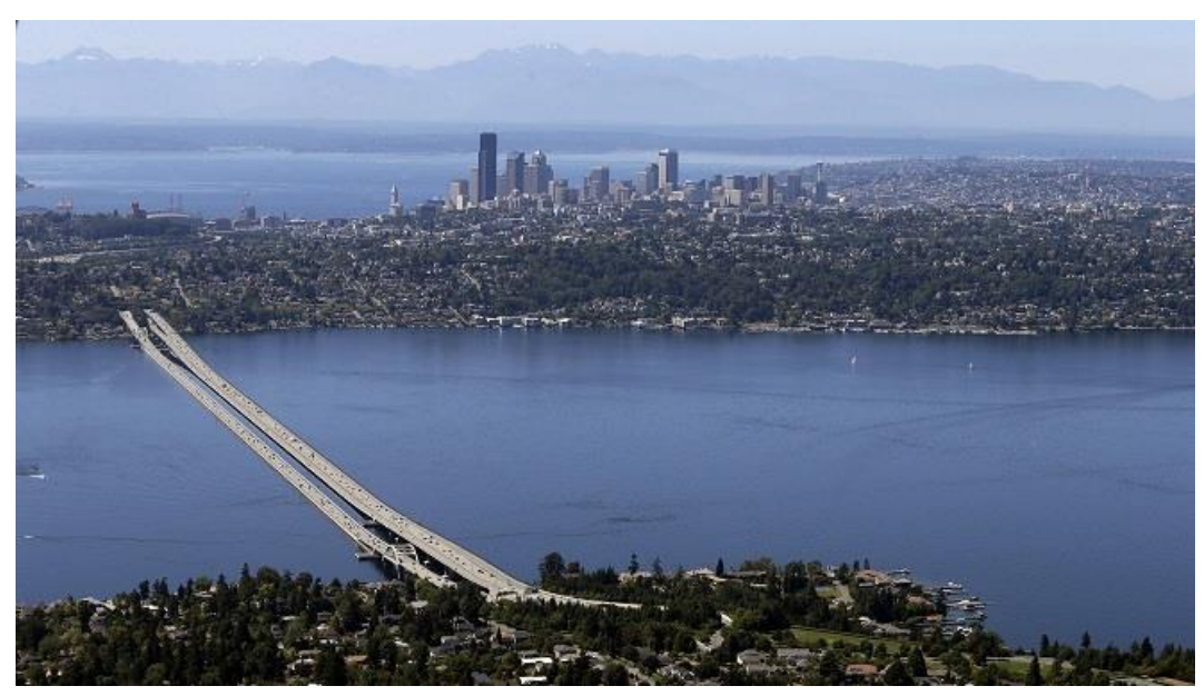
To the East, Seattle is bordered by Lake Washington