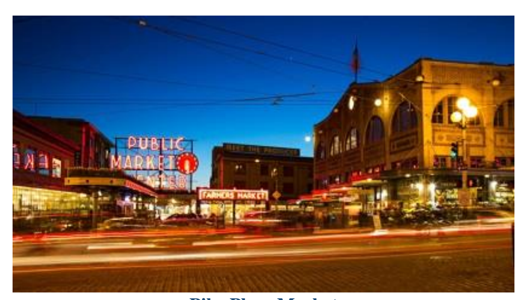
Pike Place Market