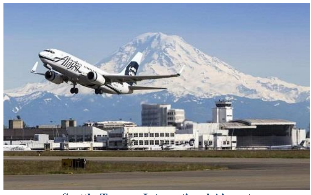
Seattle-Tacoma International Airport