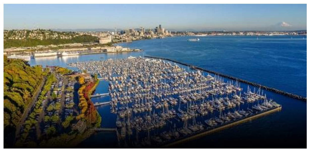
Elliot Bay Marina

The Seattle area was inhabited by Native Americans for at least 4,000 years before the first permanent European settlers arrived in 1851. The settlement was moved to the eastern shore of Elliott Bay and named "Seattle" in 1852, in honor of Chief Si'ahl of the local Duwamish and Suquamish tribes. Today, Seattle has high populations of Native, Scandinavian, European American, Asian American and African American people, as well as a thriving LGBT community.