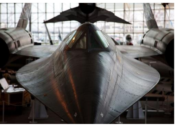
Museum of Flight