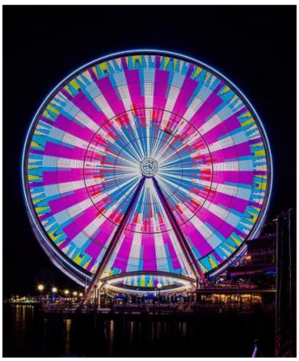
Seattle Great Wheel