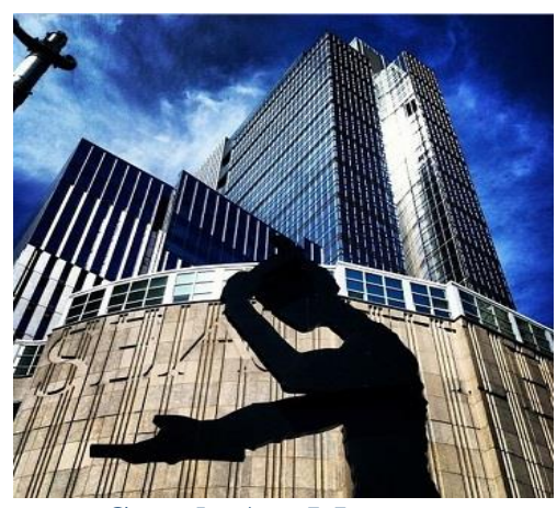
Seattle Art Museum