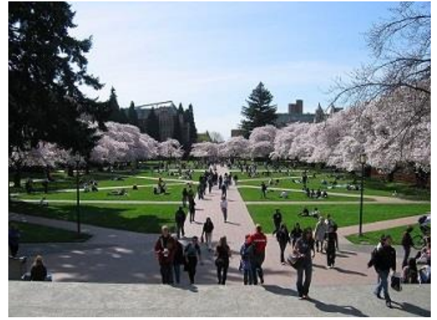
University of Washington