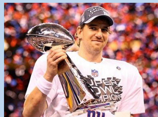
Manning and the Giants win Super Bowl XLII beating the New England Patriots 17-14