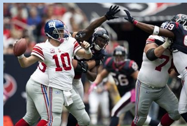
Giants lose to the Houston Texans

The Giants ended the season with a 10-6 record but missed the playoffs because of Green Bay Packers 10-3 win over the Chicago Bears. The Packers went on to win Super Bowl XLV.