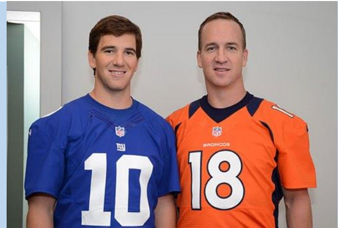
Eli and big brother Peyton Manning

Eli Manning's 2018 salary was $22.2 million.