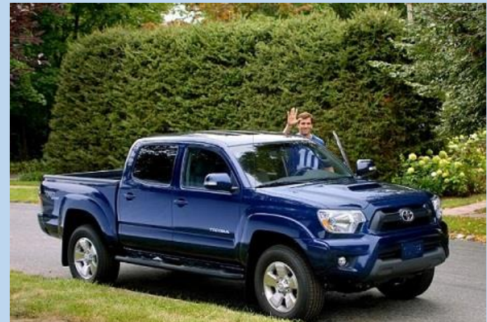
Hey, Eli drives a Toyota Truck just like me!

Eli is #2 on the all-time career NFL earning list with $235.3 million dollars. Guess who is #1 on the list?? Yes, you got it right! Peyton Manning is #1 on the all-time career NFL earning list with $249 million dollars.