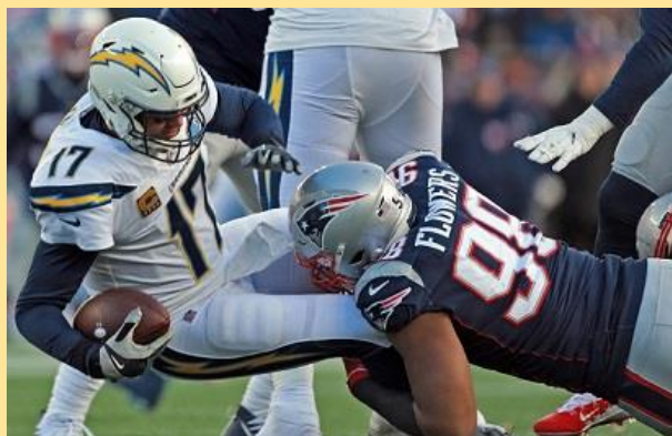
Chargers lose to the New England Patriots

Rivers led the league in passing yards, throwing for a career-high 4,710 yards - 10 yards more than second-place finisher, Peyton Manning. The Chargers finished a disappointing 9-7 and their four-year reign as AFC West champions ended while they missed the playoffs.