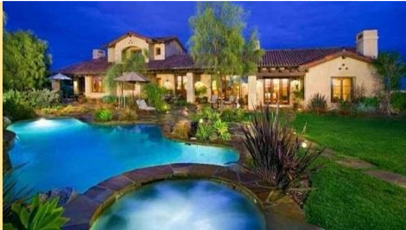
Philip Rivers San Diego Home

Rivers' 2018 salary was $20.8M. Rivers is #6 on the all-time career NFL earning list with $202.9M. His highest single-season earnings (includes the bonus) was $32 million in 2015.