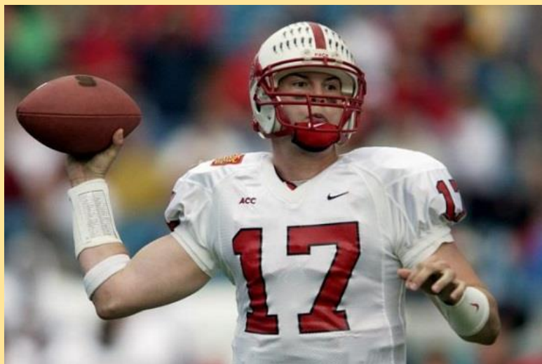
Philip Rivers – North Carolina State Wolfpack

Chuck Amato was the head football coach at North Carolina State University from 2000 to 2006 – Rivers was his QB for the first four years. Rivers beat out the QB competition and was named the starter for the first game of the season and played every game during his college career.