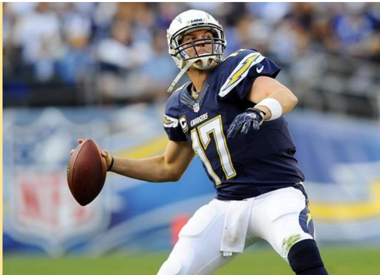
Philip Rivers – San Diego/LA Chargers

Rivers began the season as the San Diego Chargers' third quarterback, behind starter Drew Brees and backup Doug Flutie. Brees went on to have a great year and was named to the NFL Pro Bowl while winning the NFL Comeback Player of the Year Award. Rivers received very limited playing time, playing in only two games. He only threw passes in the second half of the last game (a win over Kansas City), by which time the Chargers had already clinched a home playoff spot and the AFC West division title. He threw his first touchdown pass to fellow rookie Malcom Floyd. He was not on the active roster for San Diego's playoff loss to the New York Jets.