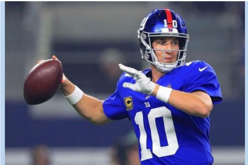
Eli Manning – NY Giants