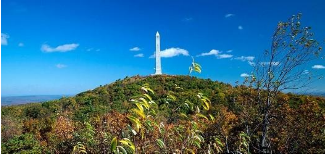
High Point Mountain

High Point is a mountain peak within High Point State Park on the border of Wantage Township and Montague Township, Sussex County, New Jersey. It is the tallest mountain in New Jersey with an elevation of 1,804 feet.