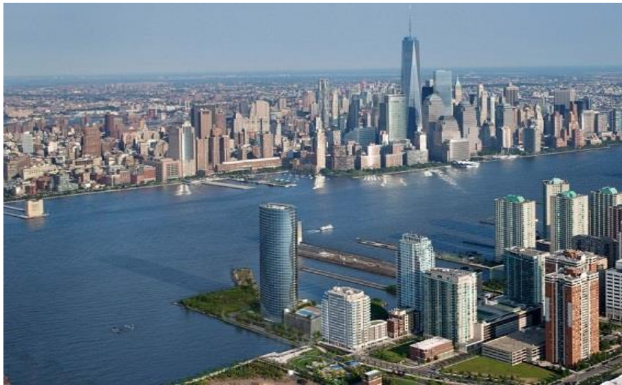
Jersey City (bottom) – New York City (top) across the Hudson River