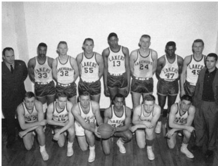
Lakehurst Base Basketball Team