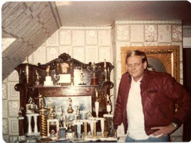
Some of the Trophies I won playing sports in the Navy (This picture was taken in my upstairs bedroom in Pleasant Grove, Utah)