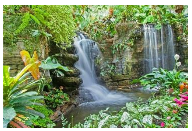
Tropical Gardens at the Gaylord Opryland Resort