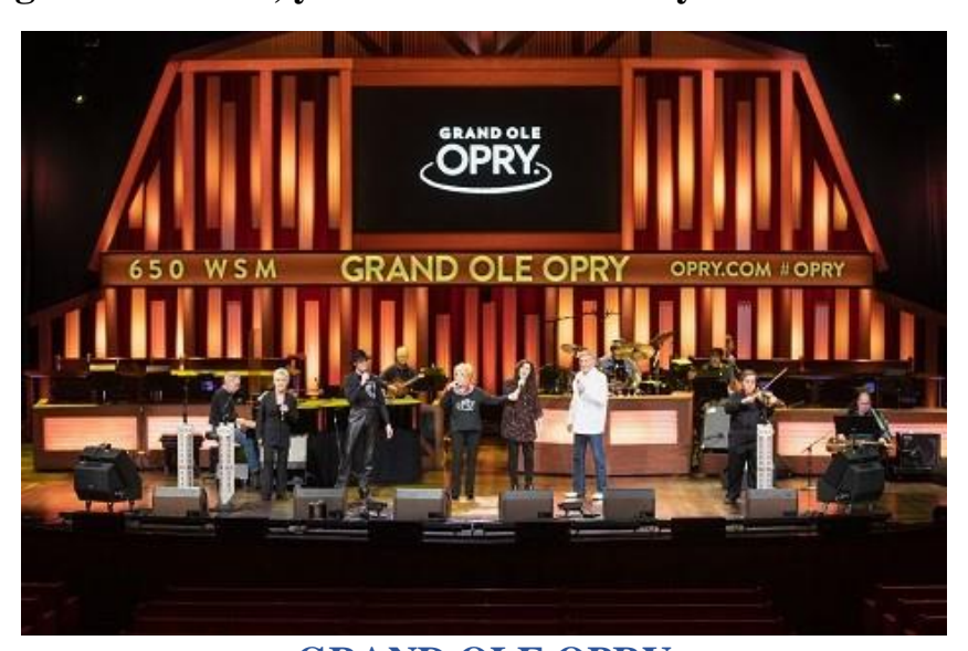
GRAND OLE OPRY

If I ever did go to Nashville, you now know where you can find me.