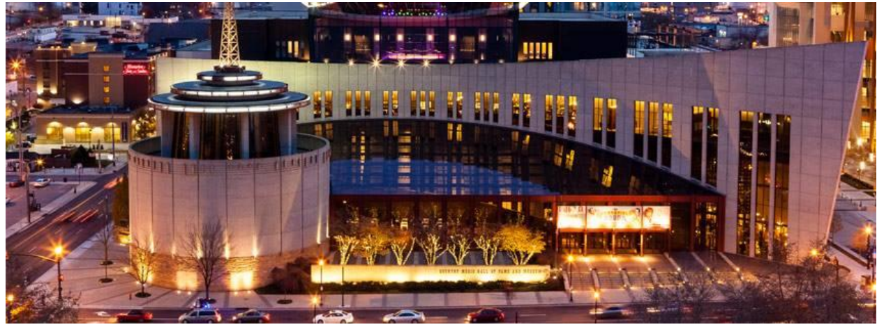
The Country Music Hall of Fame and Museum

I like country and western music! Nashville is best known for is being the capital of the country music world. Being that it is the location of the Country Music Hall of Fame, many of the biggest names in country music have come from this great city. I have visited most states and most large cities in the United States but for some reason I have never been to Nashville. In fact, I have never been to Tennessee. Darn - Nashville is one place I really wanted to go.