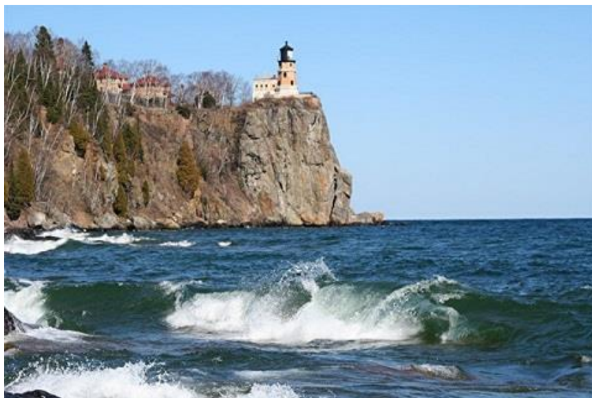
The biggest lake is Lake Superior – Shown here is the Split Rock Lighthouse

Are there really 10,000 lakes in Minnesota? No, there are 11,842 lakes of 10 acres or more. Some people in Wisconsin claim that their state has the most lakes with 15,074 but when you use the 10-acre standard, they only have 5,898 lakes. Any body of water less than 10 acres is a pond. Sorry Wisconsin and Minnesota, Alaska has over 3 million lakes! Did you know that there is one state with no natural lakes? It's true - there are no natural lakes in Maryland. All of Maryland's lakes are manmade by damming rivers.