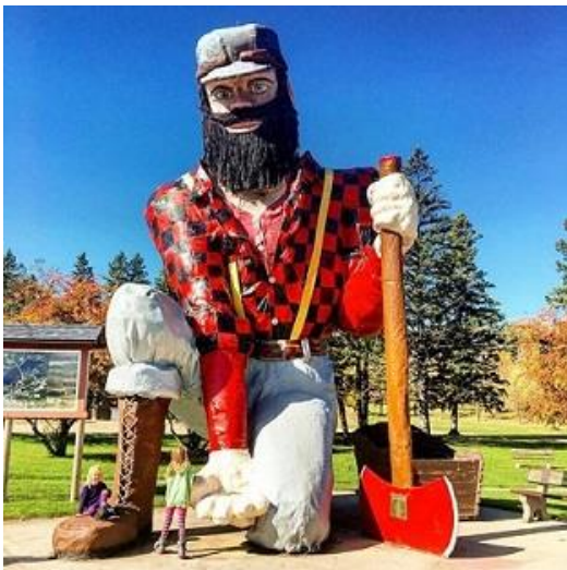
Located in the Town of Akeley

Legend has it that Minnesota's 10,000 lakes were created by Paul Bunyan's footprints filling with water as he explored the state. Since then, it has become a rite of passage for Minnesotans and visitors alike to snap their photo with the iconic lumberjack. Discover his most popular likenesses across the state and take your picture with the legend himself.