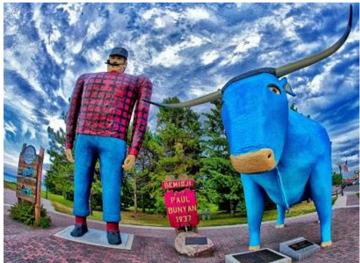
Located on the shores of Lake Bemidji

Akeley is in northwest part of Minnesota. This statue invites visitors to crawl into the palm of Paul's hand to snap a photo. While you're there, visit the nearby Paul Bunyan Historical Museum.