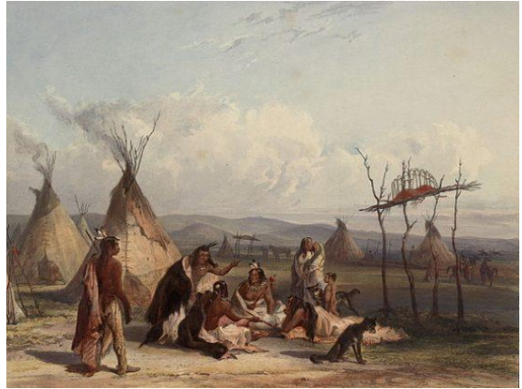
Dakota Sioux Indians

Minnesota has been inhabited by people for thousands of years including ancient cultures such as the Woodland people and the Mississippian culture. When the Europeans arrived in the 1600s, Native American tribes lived throughout the region. The largest Native American tribe in the area was the Dakota Sioux. They hunted buffalo and farmed crops such as corn, beans, and squash. Other smaller tribes included the Ojibwa, the Cree, and the Cheyenne.