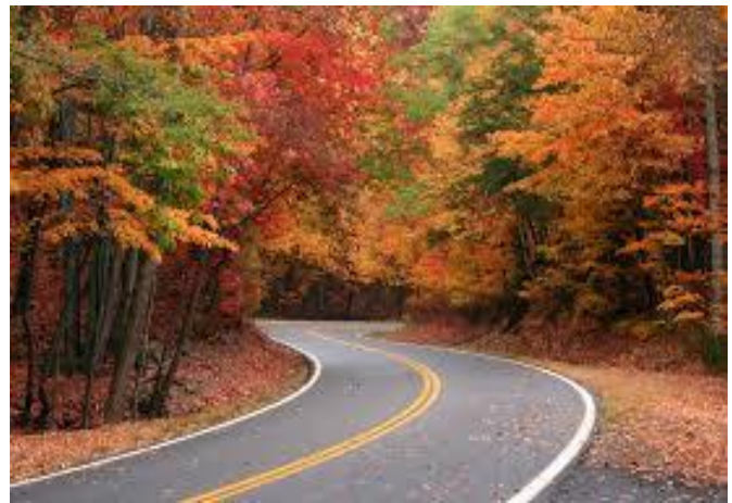
Go in the Fall for an even more scenic drive