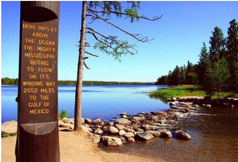
Lake Itasca – The Mississippi River Headwater

One of those 11,842 lakes is the source for the mighty Mississippi River.