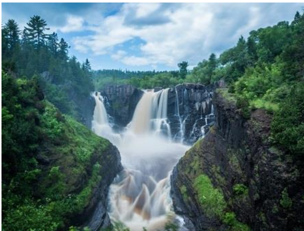
North Shore Falls in Grand Portage

The spectacular scenery of the North Shore of Superior, including eight state parks, has earned this scenic route a national designation as an "All-American Road." Small shoreline towns offer restaurants serving local fish and produce as well as unique shops and art galleries. Experience the history of the shore at the 1910 Split Rock Lighthouse, a commercial fishing museum in Tofte, and Grand Portage National Monument fur-trading post.