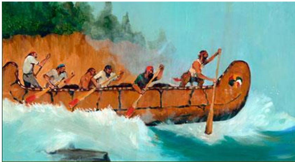
French Explorers and Settlers Cross Lake Superior

The first Europeans to arrive in Minnesota were the French. Explorers such as Pierre Radisson and Medard des Groseilleirs first visited the region in the 1650s. These early explorers mapped out the coast of Lake Superior and claimed the land for France. The French made an agreement with the Ojibwa peoples to trade for furs in 1671. French trader Sieur Du Luth explored the area and, in 1679, he helped to negotiate a peace agreement between the Dakota and Ojibwa tribes. The city of Duluth is named after him.