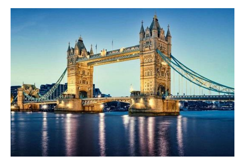
"London Bridge Is Falling Down"

Most of us (even me) are familiar with this traditional English nursery rhyme and singing game. Right? Well, did London Bridge actually fall down? No. Despite all of its structural failures, the London Bridge survived for 600 years and never "fell down" as the nursery rhyme implies. When it was finally demolished in 1831, it was only because it was more cost-effective to replace it rather than repair it. Most people outside England think the top picture is the London Bridge – that is the Tower Bridge. The London Bridge picture is below.