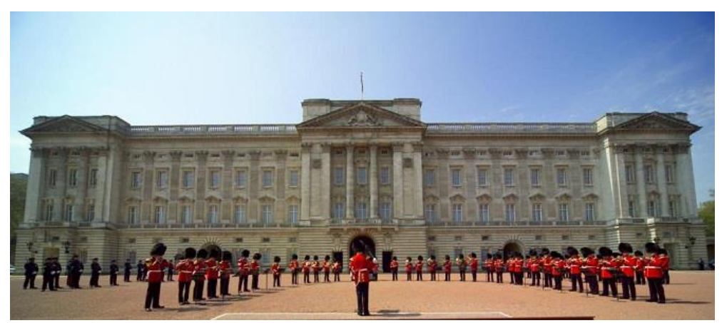
Buckingham Palace and the Changing of the Guard