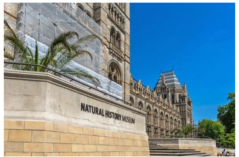
Natural History Museum