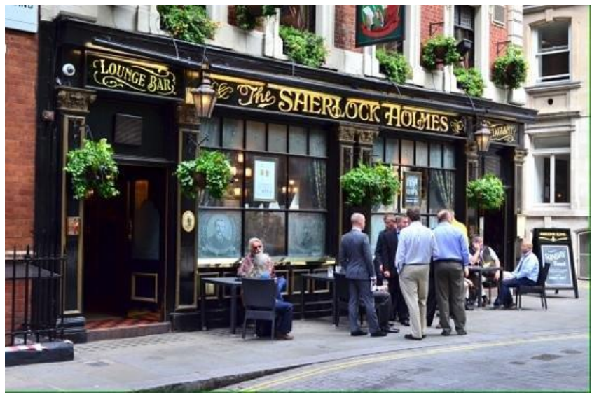
Famous Pub (There are over 3500 Pubs in London)