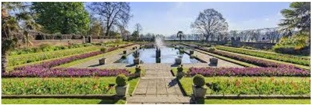
Hyde Park (The largest park in Central London)