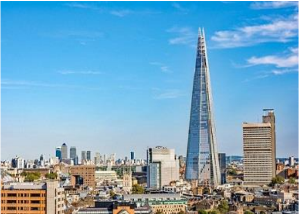
The Shard (1069 feet – 95 stories)