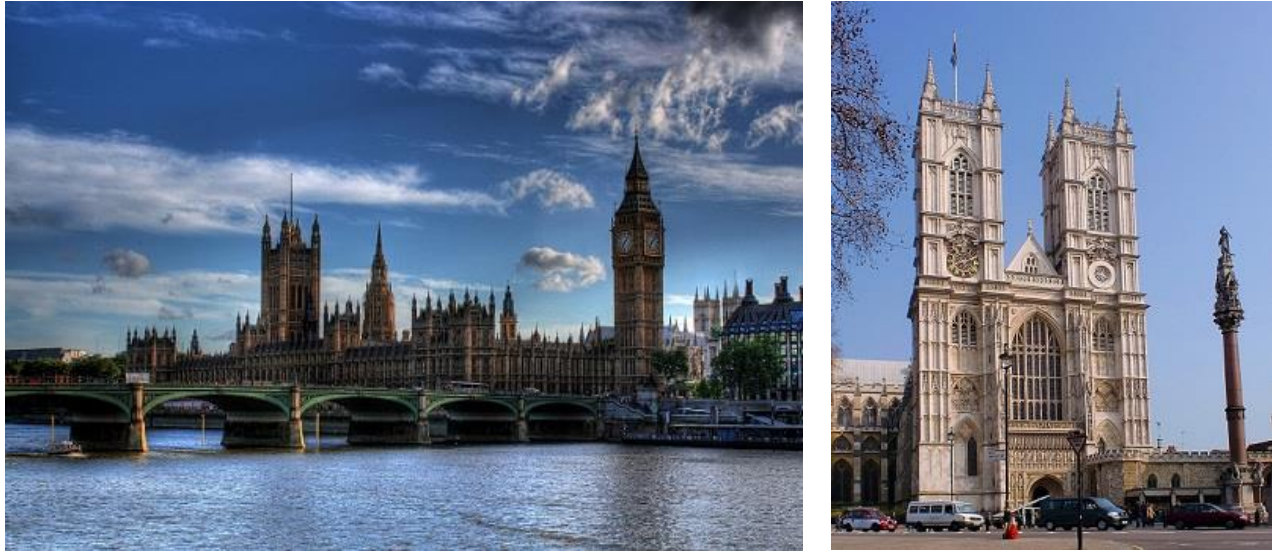
Westminster Bridge, Parliament, and Big Ben

London is the capital and largest city of England and the United Kingdom, with a population of just under 9 million. It stands on the River Thames in southeast England at the head of a 50-mile estuary down to the North Sea, and has been a major settlement for over two thousand years. The City of London, its ancient core and financial center, was founded by the Romans as Londinium and retains its medieval boundaries. The City of Westminster, to the west of the City of London, has for centuries hosted the national government and parliament. Since the 19th century, the name "London" has also referred to the metropolis around this core, historically split between the counties of Middlesex, Essex, Surrey, Kent, and Hertfordshire, which largely comprises Greater London.