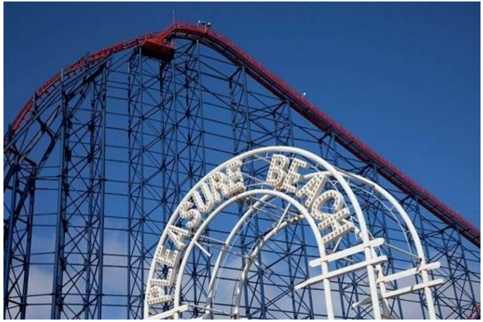
Theme Park – Pleasure Beach