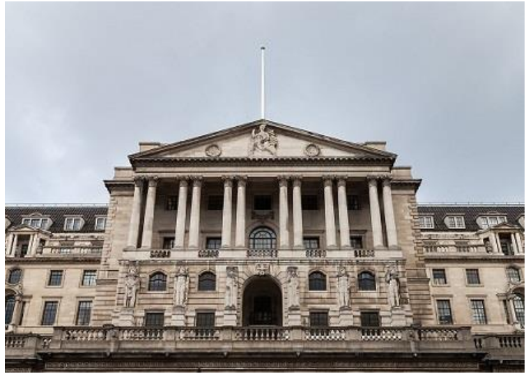
Bank of England

London's diverse cultures encompass over 300 languages. The population of Greater London of about 9 million make it Europe's third-most populous city (after Istanbul 15,850,000 and Moscow 12,650,000), accounting for over 13% of the population of the United Kingdom and over 16% of the population of England. The London metropolitan area is the third-most populous in Europe with about 14 million inhabitants.