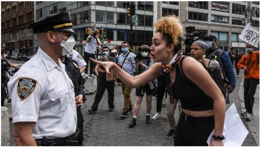
Protester Screaming at a Police Officer

Now, police departments are worried about having enough officers to keep their communities safe. It turns out that when you spend months vilifying police officers and demonizing them for doing their jobs, some of them no longer want to stay. To me, this is perhaps the worst consequence of the defund the police movement. Resources and equipment can be built back up again, but it's a lot harder to replace good, seasoned officers – particularly right now, when it's difficult to imagine why anyone would want to become a police officer. Why would men and women sign up for a job where they are regularly characterized as the worst kind of criminals? The sickening scene of protesters shouting "death to police" outside a hospital where two ambushed law enforcement officers were fighting for their lives has to be emblazoned on the minds of police officers nationwide.