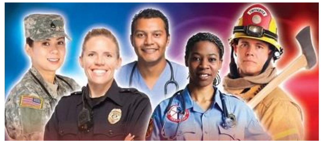
First Responders deserve our Praise, Respect and Thanks for keeping us all safe