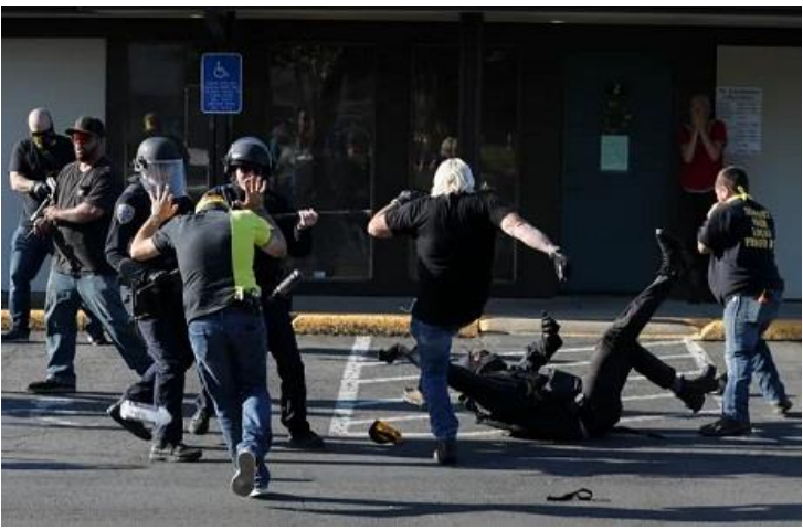
Protesters Attack Police in Portland, OR

1. Refuse to follow orders and/or try to beat up the police officer.