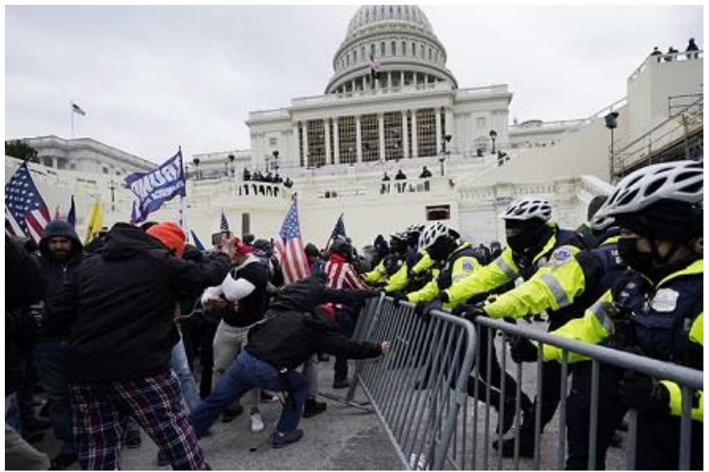
U.S. Capitol Police trying to stop attack on our nation's Capital Building

Most sociologists, criminologists, and journalists have criticized aspects of the police defunding movement. In the United States, politicians from both the Democratic and Republican parties have spoken against defunding, although Republicans have sought to link Democrats to the movement in congressional races, and in 2021, the Biden administration rebutted by arguing Republicans were trying to defund the police. Among the general public, the concept of defunding the police is very unpopular.