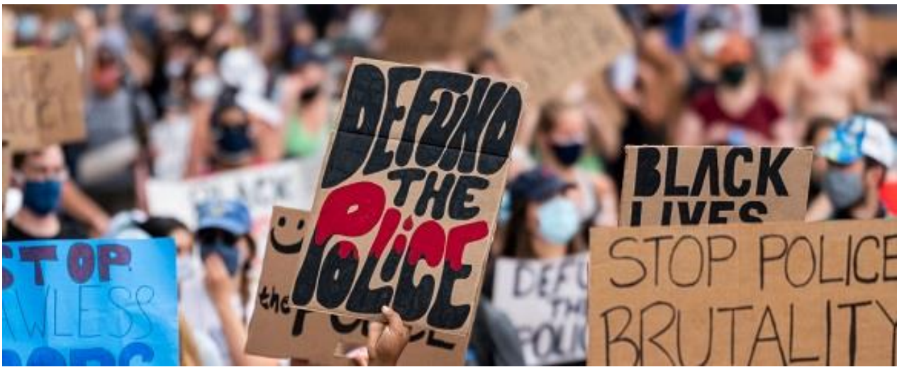
The "Defund the Police" movement that started after George Floyd was killed by police in Minneapolis is one of the dumbest things I have ever heard of in my life.