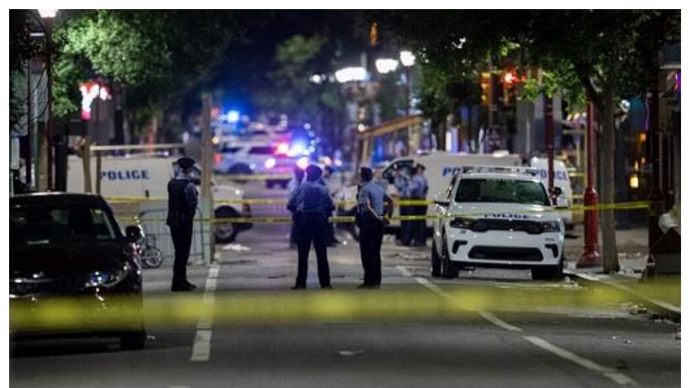
Gangs, Thugs, and other Criminals have made parts of Philadelphia unsafe

It's shaping up to be another grim year for Philadelphia, which is on pace to eclipse last year's homicide record. Plus, overall violent crime is surging, and robberies have more than doubled in 2022 compared to 2021, according to city data.