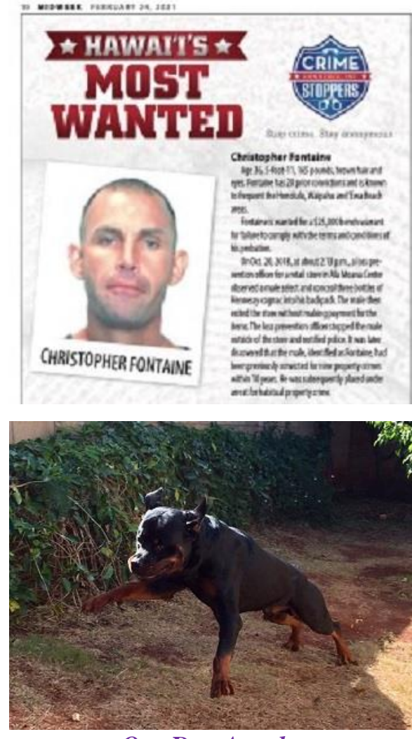
Our Dog Apache

Do you know what this tells me? Hawaii police are doing a good job of catching the bad guys and gals, but our court system seems to be turning them loose. Even so, Hawaii is one of the safest states in the U.S. We have lived in our house in Mililani since 1975 and never had a break-in or anything stolen. We do have a great security system – A Rottweiler!