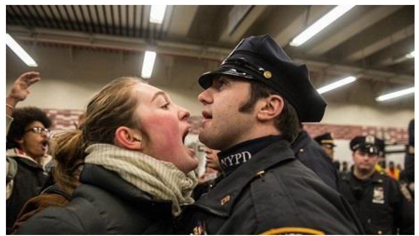
Women Yelling at Police Officer in New York City

Have you noticed that there seems to be a big increase in the number of people (especially young people) who don't respect authority and do pretty much what they want. These people don't listen to their parents, teachers, or the police.