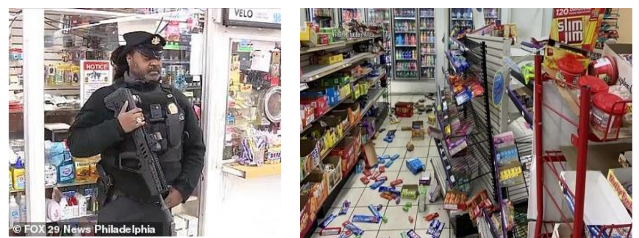
Philadelphia gas station owner hires security guards armed with AR-15s and dressed in Kevlar vests to protect his station and store after it had been repeatedly robbed and ransacked in this crime-ridden city