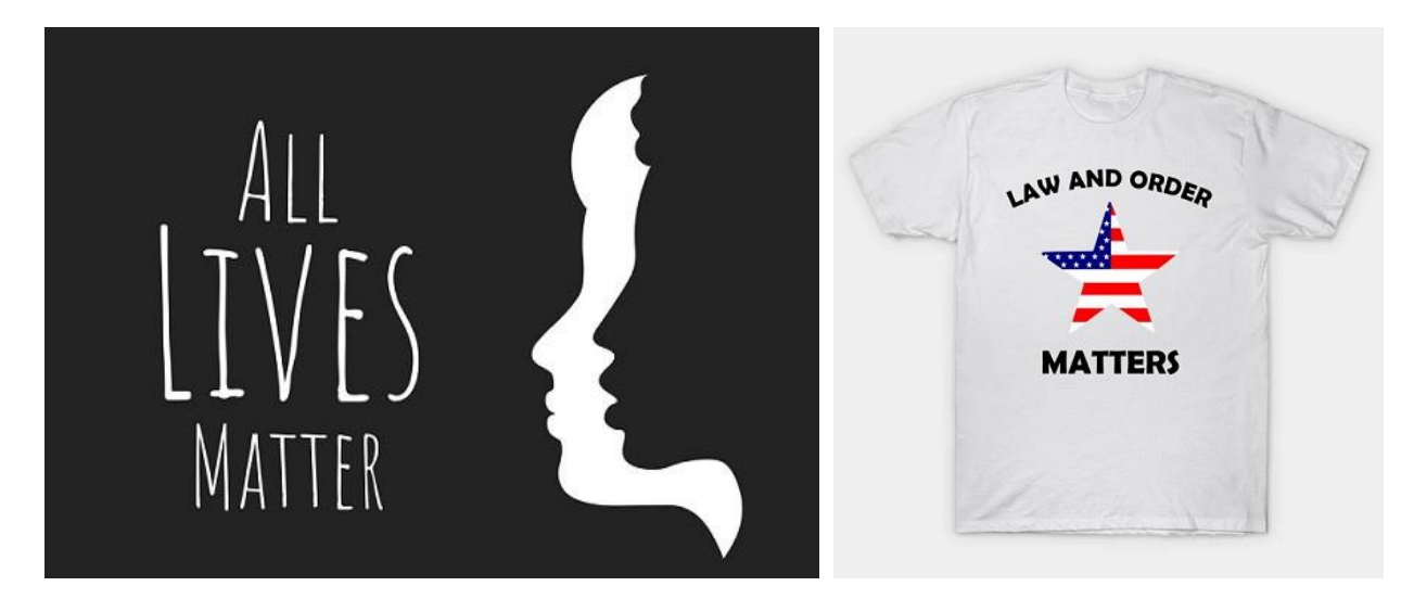
The U.S. is a country based on LAW and ORDER. We need more police and more jails/prisons especially with all this crap going on today in our country.