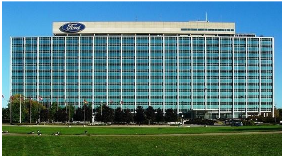
Ford Headquarters in Dearborn

Henry Ford was born on a farm here and later established an estate in Dearborn, as well as his River Rouge Complex, the largest factory of his Ford empire. He developed mass production of automobiles and based the world headquarters of the Ford Motor Company here. The city has a campus of the University of Michigan as well as Henry Ford College. The Henry Ford, the United States' largest indoor-outdoor historic museum complex and Metro Detroit's leading tourist attraction, is located here.