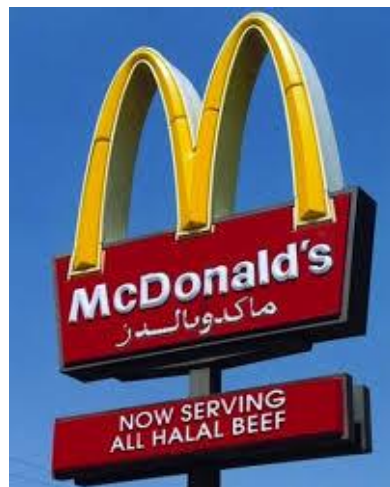
McDonald's in Dearborn