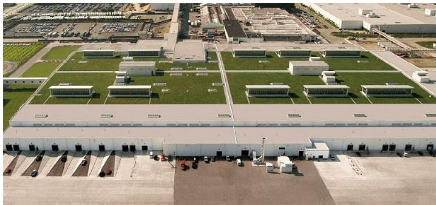
Rouge River Ford Complex