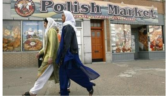
Hamtramck is almost a completely Muslim community

Hamtramck, population 23,000, is a majority-Muslim city and is governed by only Muslims while Dearborn is considered the “Muslim capitol of the US,” with a population over 50% Islamic, and is home to America’s biggest Mosque (See header picture on page 1). In fact, it is the largest mosque in North America and the oldest Shia mosque in the United States. With its large Shia Arab population, Dearborn is called the "heart of Shiism" in the US.