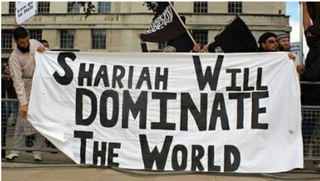
The Islamic Agenda Does Not Stop with The United States

Islamic Muslim expansions have unfolded across the world, throughout history, and many Western countries are experiencing their own struggles with this very thing today.