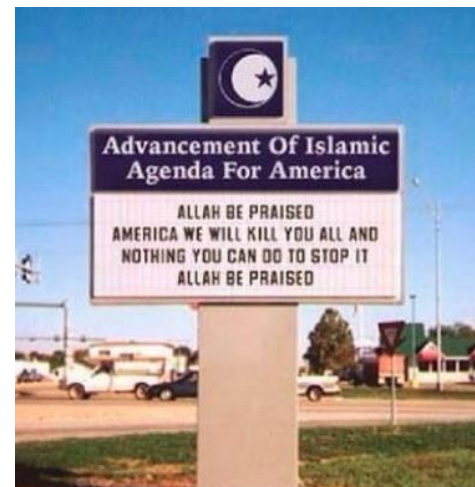
The Islamic Agenda