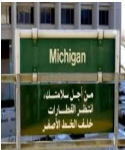
Street Signs in Arabic