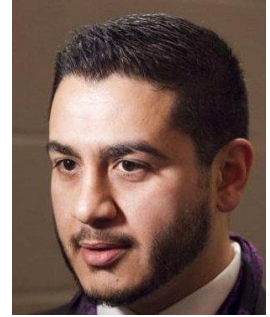
Dr. Abdul el-Sayed

Now, Michigan may be headed towards becoming the first state in American history to elect a Muslim governor, a man named Dr. Abdul el-Sayed. At only 34, el-Sayed has accomplished a lot already; he's a doctor, a teacher, and was a candidate for the governor of one of the largest states in the US.