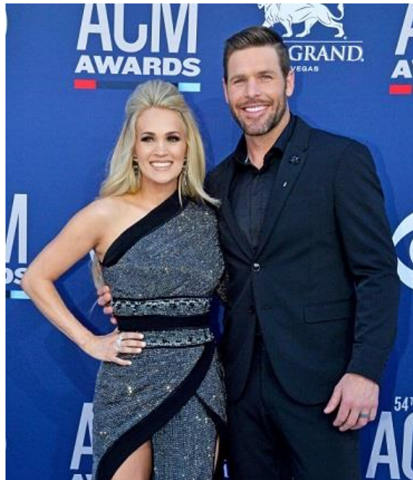
Carrie Underwood and Mike Fisher

Underwood began dating NHL player Mike Fisher after they met at one of her concerts in late 2008, and they became engaged in December 2009. According to the Canadian press, Fisher proposed in Ottawa on December 20, 2009. Underwood's engagement ring features a yellow diamond and was valued at $150,000. On July 10, 2010, Underwood and Fisher wed at the Ritz-Carlton Lodge in Greensboro, Georgia, with more than 250 people in attendance. The couple's first son was born on February 27, 2015. Their second son was born on January 21, 2019.