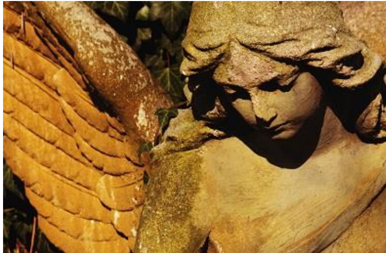
Face of an Angel

You can break old patterns and create healthier new habits easier with their support. Request their aid in living a balanced lifestyle. Elicit their service to heal your diseases and maintain unwavering hope and patience during your healing process. Use their help to keep you in the present moment, and not regretting the past or worrying about the future.